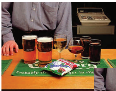
This is what you sold ▲

COLA 1.10 LAGER 2.50 TOTAL 3.60 CASH 10.00 CHANGE 6.40 07-08-03 12:01 TILL 0005 3956